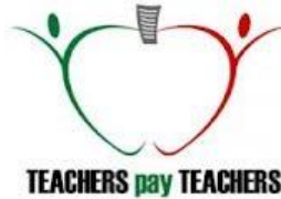
Teachers Pay Teachers